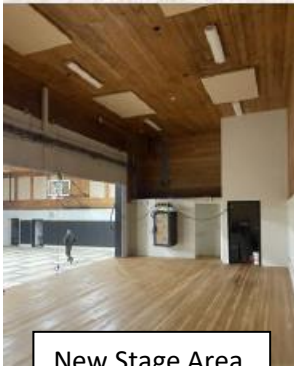
New Stage Area

Fire and Life Safety are driving many of the decisions. The gymnasium has been redone with a new scoreboard, backboards, an updated stage area, storage rooms, restrooms, upgraded kitchen, and a large meeting room. Accessibility is improved with ADA ramps and entrances for the facility. New HVAC, electrical, and plumbing are included. Other upgrades include small seismic modifications, replacement of all the windows and doors, and paint for the entire building, inside and out.