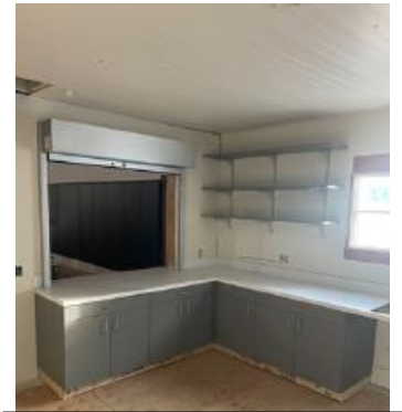
New Kitchen Pass Through

The City will be holding an open house for the public to view the newly refurbished facility on February 22 nd , 2024 from 7:00 – 8:30 p.m. The renovation project has been a mix of preserving the old, and embracing new modifications and upgrades. Mark your calendars! You will want to come and see it!