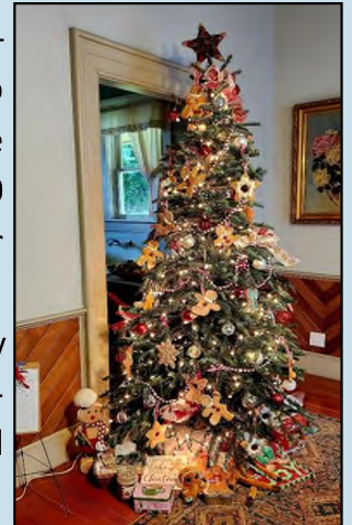
2023 Moyer House Tree

Later in the month, free tours of the Moyer House will take place during the week between Christmas and New Year's.